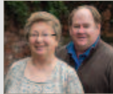
THE CHURCHILL TEAM